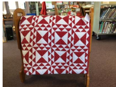
Amish quilt on display for silent auction

Our silent auction opens this month and runs through 4:00 p.m. on December 13th, Christmas in Essex Day. This is our biggest auction yet with over 30 items up for bid, including a beautiful queen-sized Amish quilt, a two-night stay at the Whiteface Lodge, a sail on Lake Champlain, yoga lessons, original art, gift certificates to local restaurants, and much, much more. Your participation allows us to provide a full range of library services.