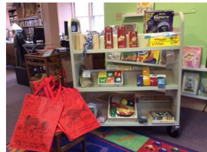
Educational toys ready for checkout