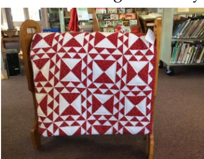
Amish quilt on display for silent auction

Our silent auction opens this month and runs through 4:00 p.m. on December 13th, Christmas in Essex Day. This is our biggest auction yet with over 30 items up for bid, including a beautiful queen-sized Amish quilt, a two-night stay at the Whiteface Lodge, a sail on Lake Champlain, yoga lessons, original art, gift certificates to local restaurants, and much, much more. Your participation allows us to provide a full range of library services.