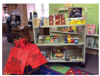
Educational toys ready for checkout