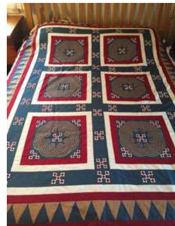
This beautiful quilt can be yours!

Our silent auction opens this month and runs through 4:00 p.m. on December 12, Christmas in Essex Day. This is our biggest auction yet including a queen-size Hmong quilt, a two-night stay at the Whiteface Lodge, an authentic Moroccan dinner, a sail on Lake Champlain, an antique cradle, and much, much more. Your donations and purchases are a great help to the library!