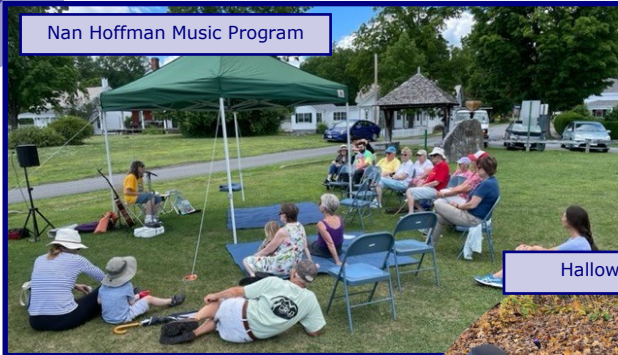
Nan Hoffman Music Program