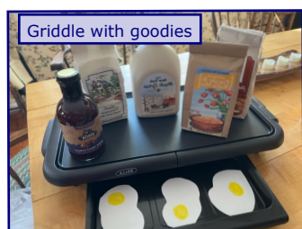
Griddle with goodies