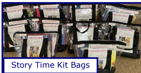
Story Time Kit Bags

We applied for, and received, a grant from the Adirondack Foundation's Generous Acts program which allowed us to create 11 Grab and Go Story time kits. Each kit is based on a theme including ABCs, Bears, Bedtime, Colors, Counting, Clothing, Dinosaurs, Farms, Food, Going To School, and Vehicles.