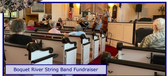
Boquet River String Band Fundraiser