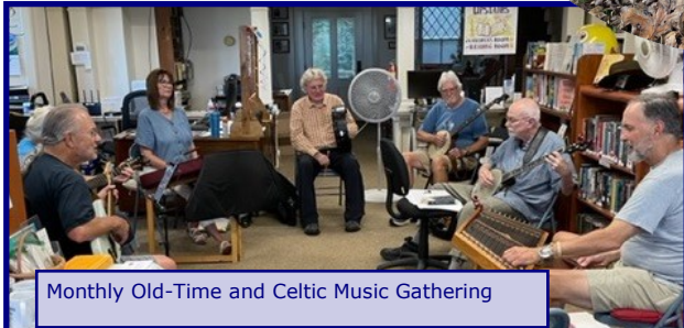
Monthly Old-Time and Celtic Music Gathering