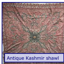
Antique Kashmir shawl