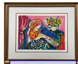
Zamy Stenovitz silk screen