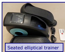
Seated elliptical trainer